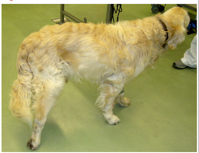
A case of canine TBE with hemiparesis and spontaneous dorsal paw placement.