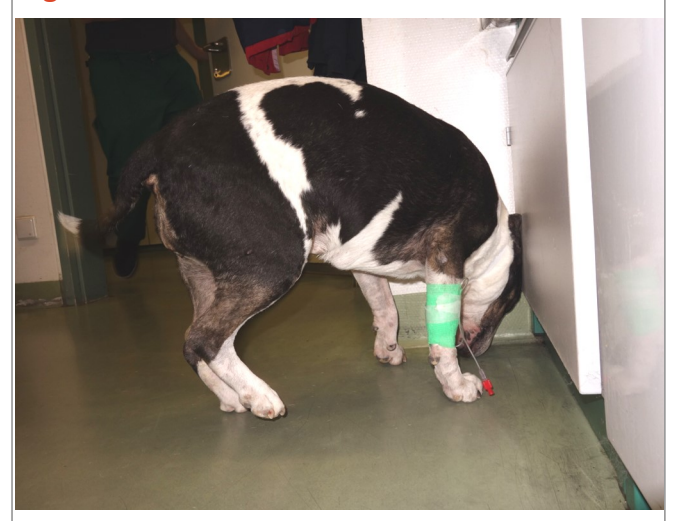
Acute head pressing with concurrent compulsive walking and disorientation on day 2 of a dog with TBE.