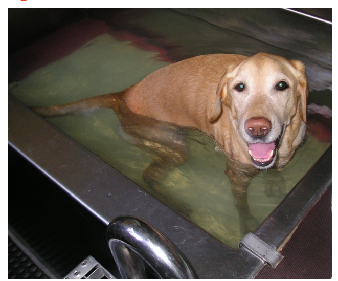
An old Labrador Retriever during rehabilitation. Water training over months improved muscle strength and coordination.

mandatory to effectively protect the brain tissue from further fulminant immune response. In cases of muscle atrophy and paresis, physiotherapy (Figure 6) as early as possible has been shown to improve the general outcome and shorten the time of rehabilitation.<sup>30,31</sup>