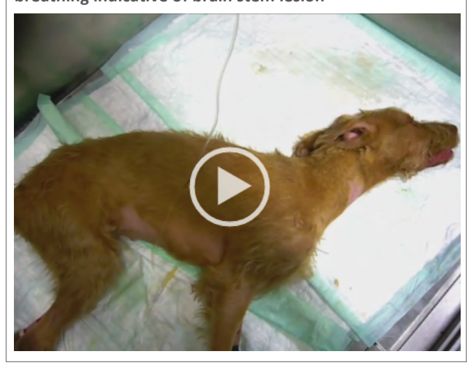
Video: Comatose dog of Figure 3 with arhythmical breathing indicative of brain stem lesion

Involvement of the brainstem may result in symptoms like arrhythmical breathing and disorder of other vital functions. Prognosis of such severe cases is very guarded. Major involvement of the spinal cord results in mostly symmetrical paresis, muscle twitching, and proprioceptive dysfunction (38-50%), which may also be present as an exclusive symptom and may occur asymmetrically (Figure 5). 10,28,30,31