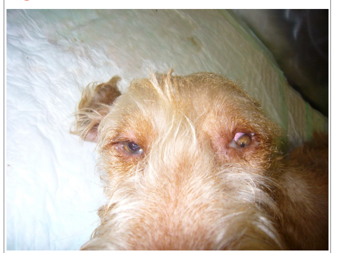
A comatose dog in lateral recumbency with severe brain stem encephalitis leading to anisocoria and left-sided strabismus.

Brainstem symptoms like arrhythmical breathing pattern may be present in comatose dogs, especially in severe cases with guarded prognosis (see Video — <a href="https://id-ea.org/tbe/wp-content/uploads/2017/08/VIDEO">https://id-ea.org/tbe/wp-content/uploads/2017/08/VIDEO</a> TBE breathing-dog.mp4)