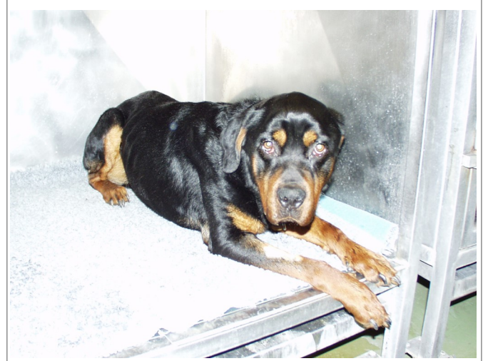
A Rottweiler during recovery after chronic disease over 3 months – remarkable weight loss due to systemic muscle atrophy.

The elevated body temperature (42–66%) may initially be classed as fever; later on, it is more likely a result of non-voluntary excessive muscle contraction (e.g., seizures, loss of inhibition by upper motor neuron damage). Seizures are a principal result of cerebral damage due to TBEV infection and are observed in 12–33% of canine cases. <sup>28,30</sup> Neurological symptoms like paresis (8–38%), vocalization due to painful perception of active and passive back movement (21–66%), and deficits of the cranial nerves (16–50%) (Figure 3) develop within a few hours thereafter.